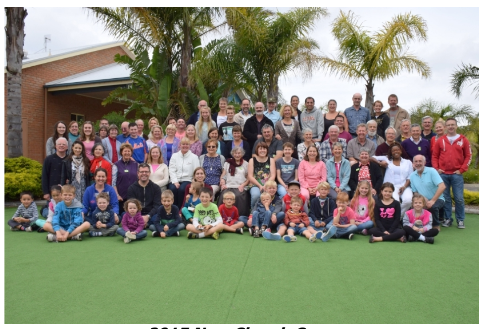
2015 New Church Camp

Where two or three are gathered together in my name there am I in the midst of them