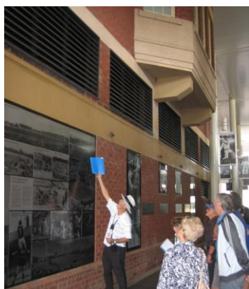
Here is the Tour Guide, showing us The Hall of Fame and timeline of the cricket here.

There are even some special Heritage Listed Trees at the edge of the grassed area at the Cathedral end. These were planted at the end of the 1800's and early 1900's, by the King and Queen at the time, visiting Adelaide and Australia. Beautiful magnificent trees that grace the grassed Family area and give some shade too.