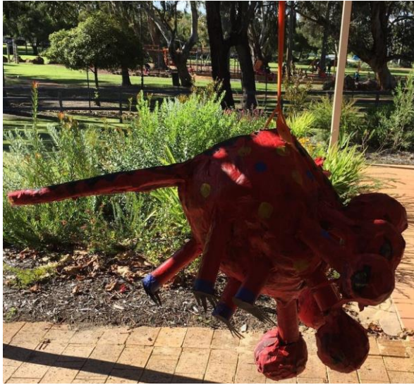
Presentation of gifts by Deb: Note Michael's sword waiting on the altar to be used to fight the dragon. (see below)