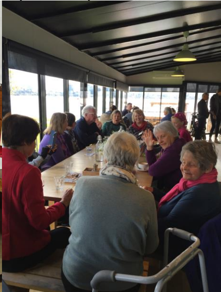
Morning tea for July birthdays at the Boatshed. (see above)