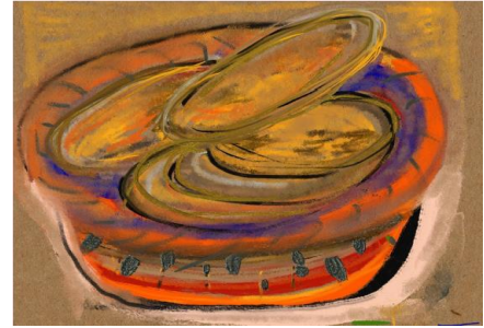
Art Work By Lenore Sandow

For the hour of His judgment is come, signifies the separation of those who live according to Divine truths from those who do not live according to them.