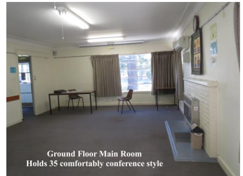
Ground Floor Main Room Holds 35 comfortably conference style

air-conditioned and heated. There is also a well-appointed kitchen on the ground floor adjacent to the main meeting room and twelve allocated parking spots and plenty of parking nearby on Sundays.