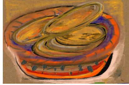
Art Work by Lenore Sandow