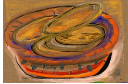
Art Work by Lenore Sandow