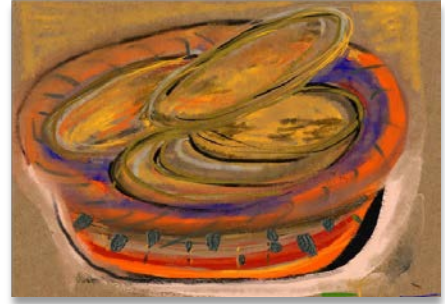
Art Work By Lenore Sandow