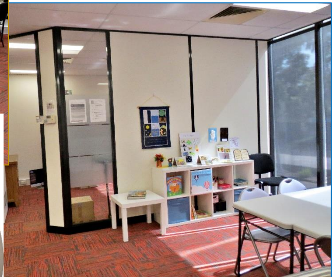
Spiritual Leaders Office & Children's activities areas on first floor

Areas not shown: 6 external parking bays; 2 internal parking bays; 3 toilets (disabled, female & male)