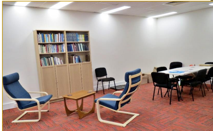
First floor library reading and smaller meeting areas