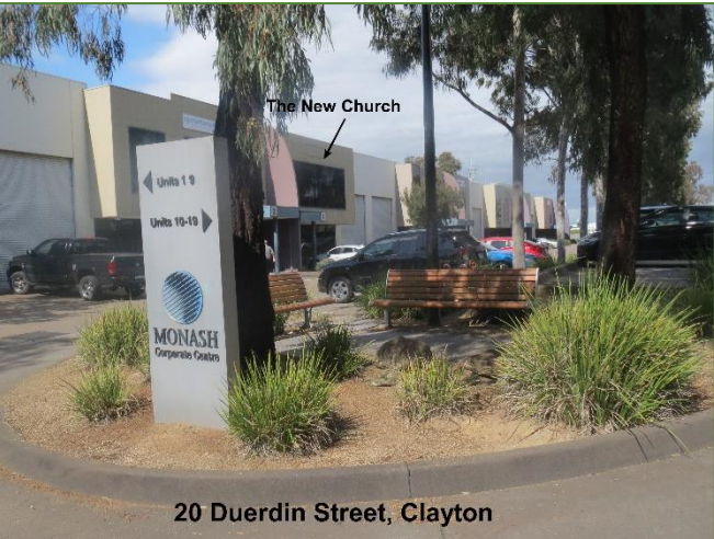
Entrance to premises (signage still to be completed)