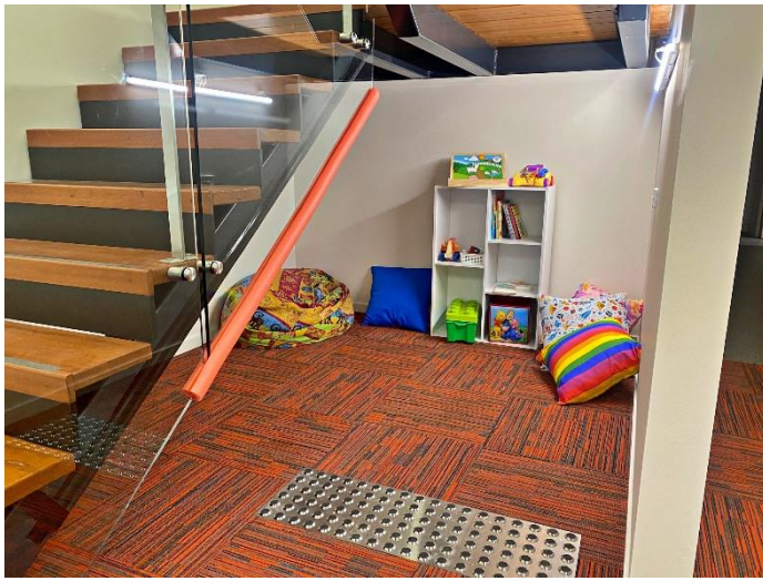
Children's play nook