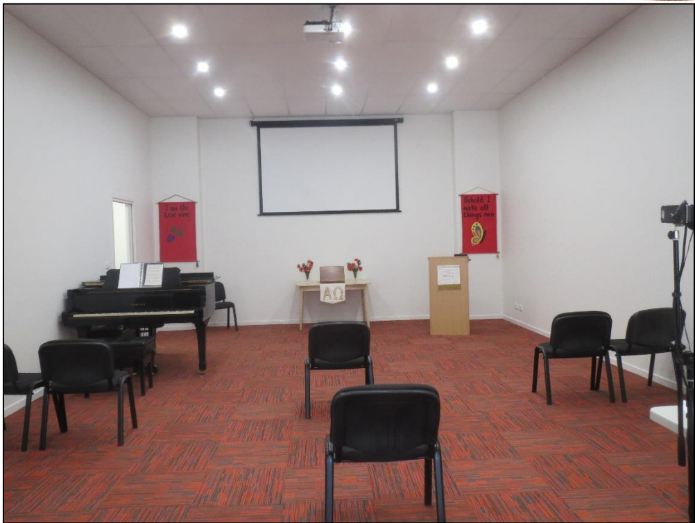
Multipurpose Meeting Room